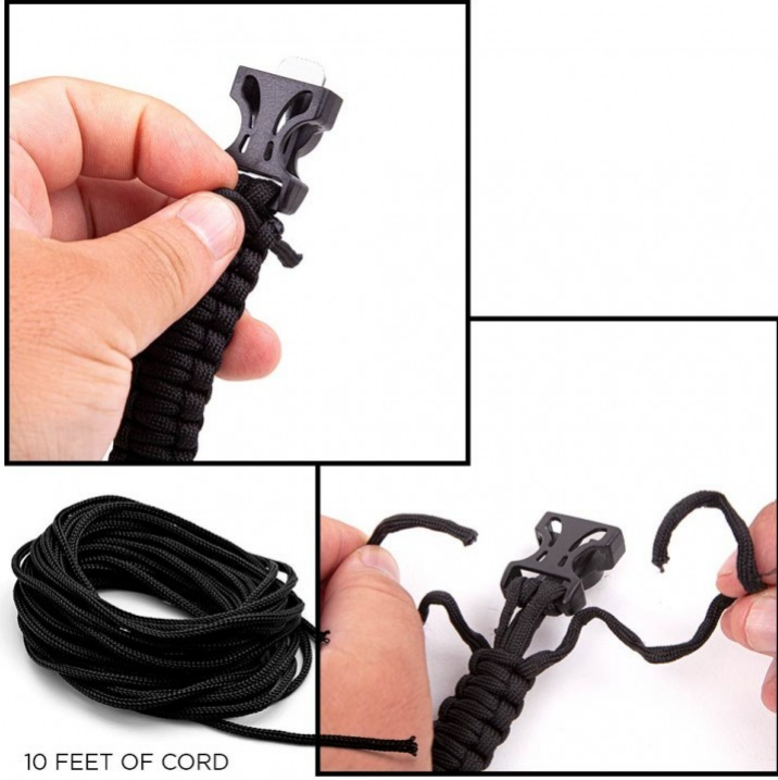
10 FEET OF CORD

URL Link: https://promotionalproductsaus.com.au/product/survival-band